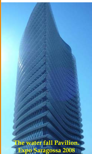
The water fall Pavilion. Expo Saragossa 2008